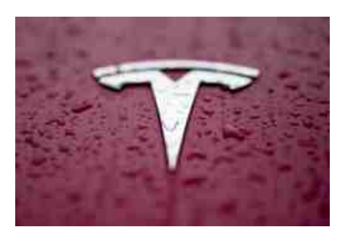
FILE – A Tesla logo is shown on Feb. 27, 2024, in Charlotte, N.C.